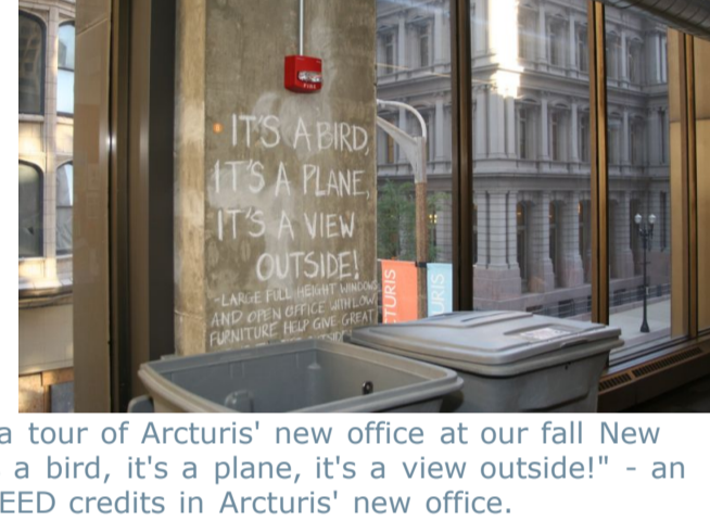
Above left: Chapter Members on a tour of Arcturis' new office at our fall New Member event. Above right: "It's a bird, it's a plane, it's a view outside!" - an example of signage referring to LEED credits in Arcturis' new office.

Be sure to check out the LEED page on our website for a map and listing of all local LEED certified projects (excepting a few of the LEED projects which still need to be added)!